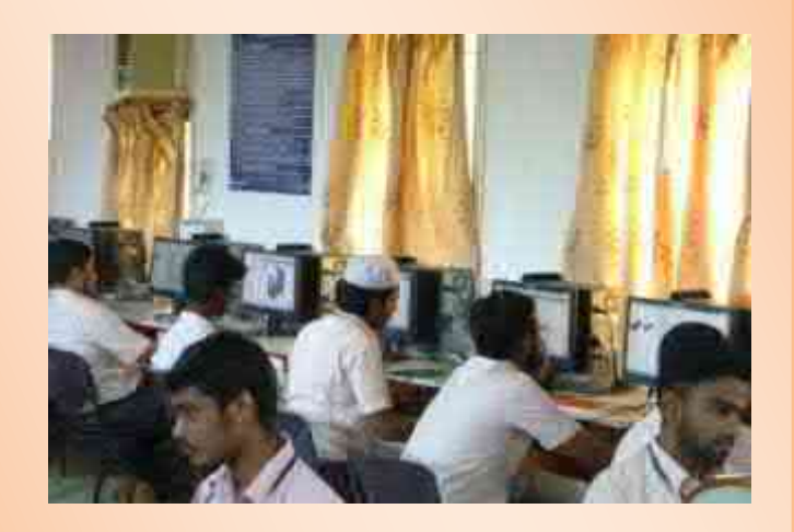
Students participated in DESIGN NOW COMPETITION